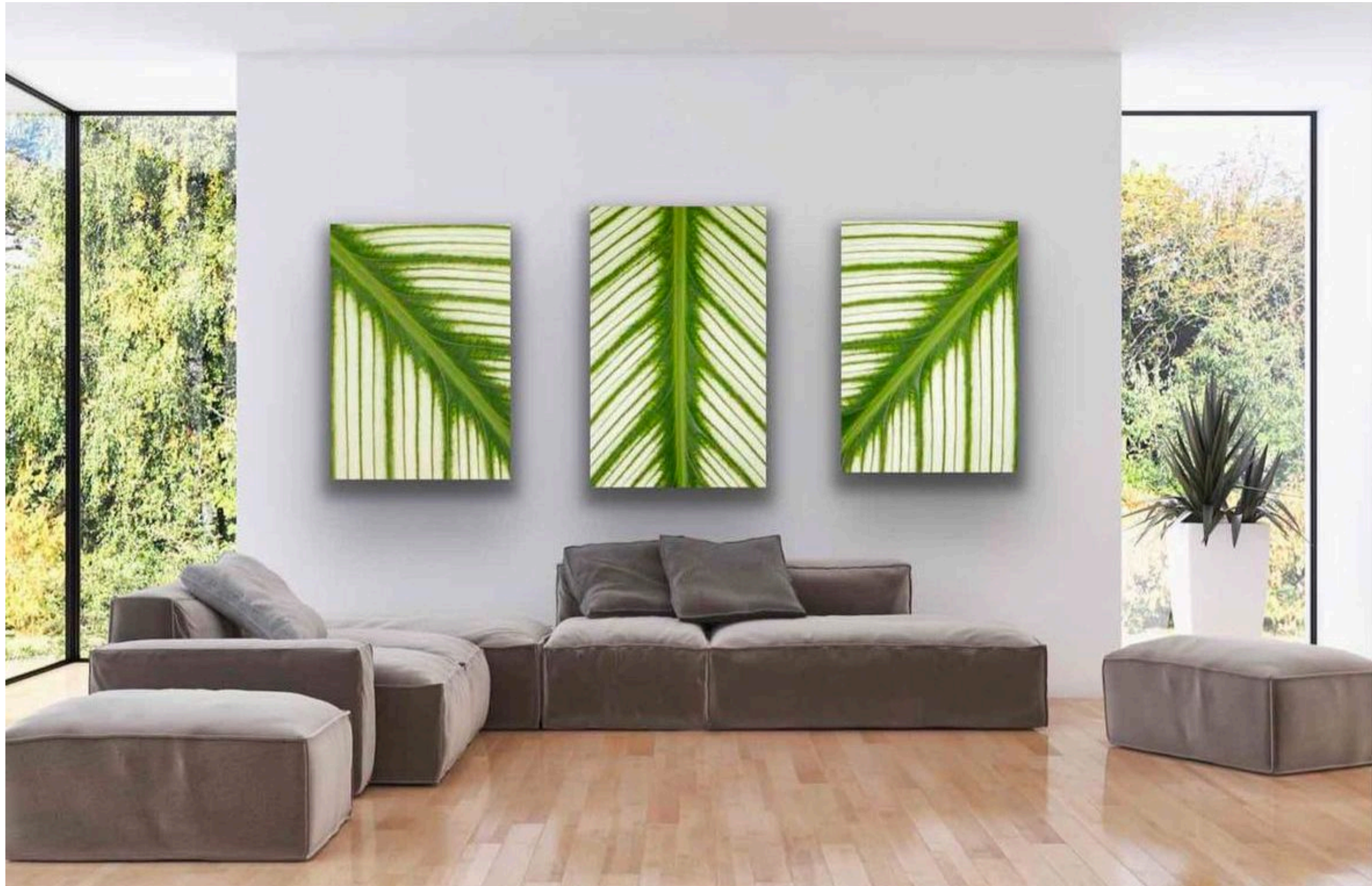
Visual example All Roads I, II, III