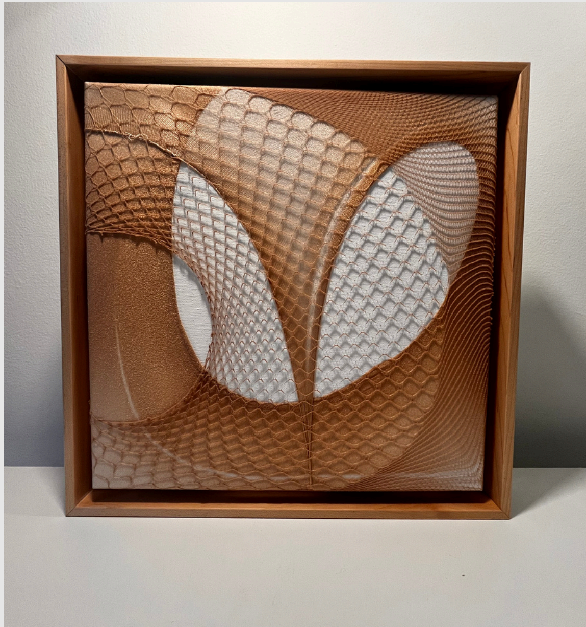
Title: Las Partes de uno Medium: nylon stockings on canvas Dimensions: 13.5" x 13.5"

This series is a journey through self-exploration, peeling back and observing the different parts of yourself as they reveal themselves in your relationships with others and, most importantly, with yourself.