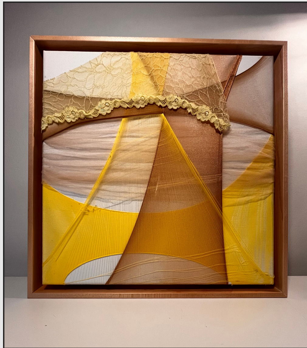
Title: Ruptured Harmony Medium: nylon stockings, tulle & lace Dimensions: 15.5" x 15.5"