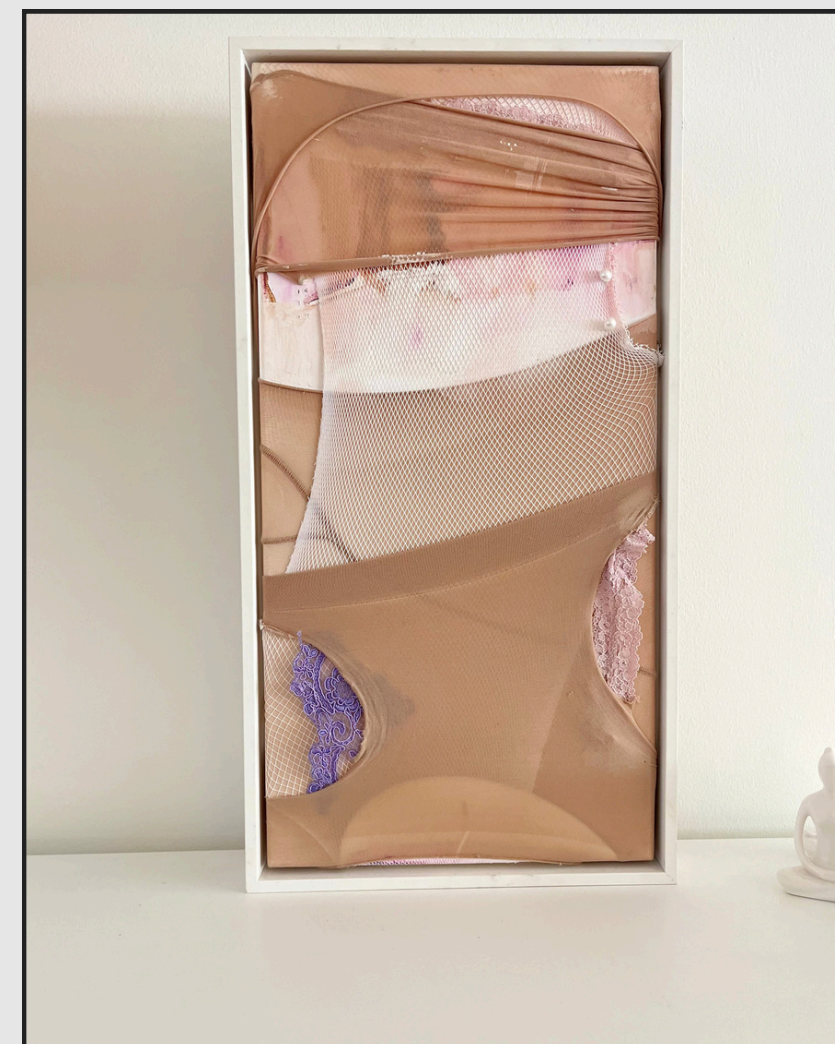
Title: Scars of a Toxic Love Medium: Pantyhose, lace, & buttons & oil painting Dimensions: 13 x 25