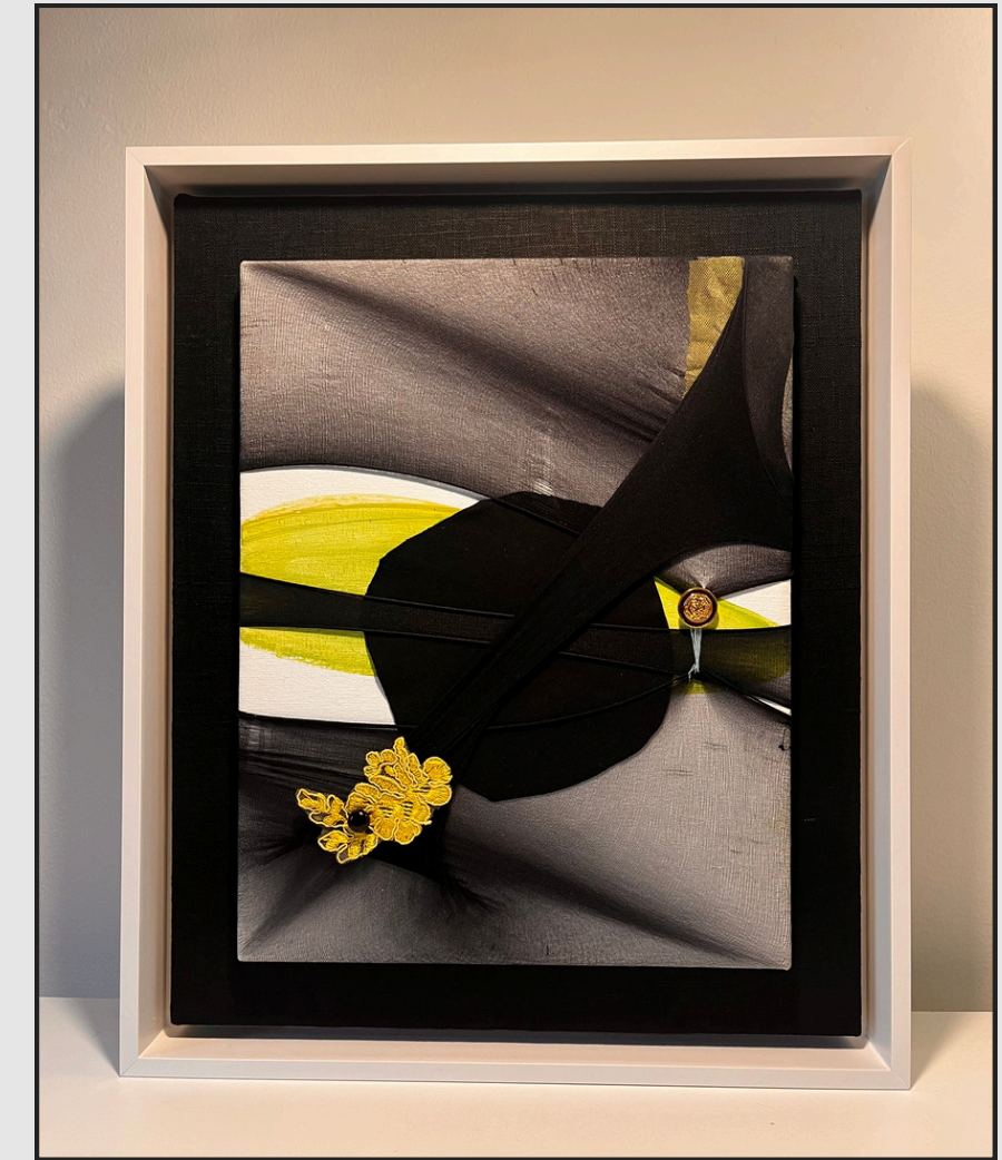
Title: Unbuttoning Feelings Medium: Nylon, oil painting & buttons Dimensions: 18.5" x 15.5"