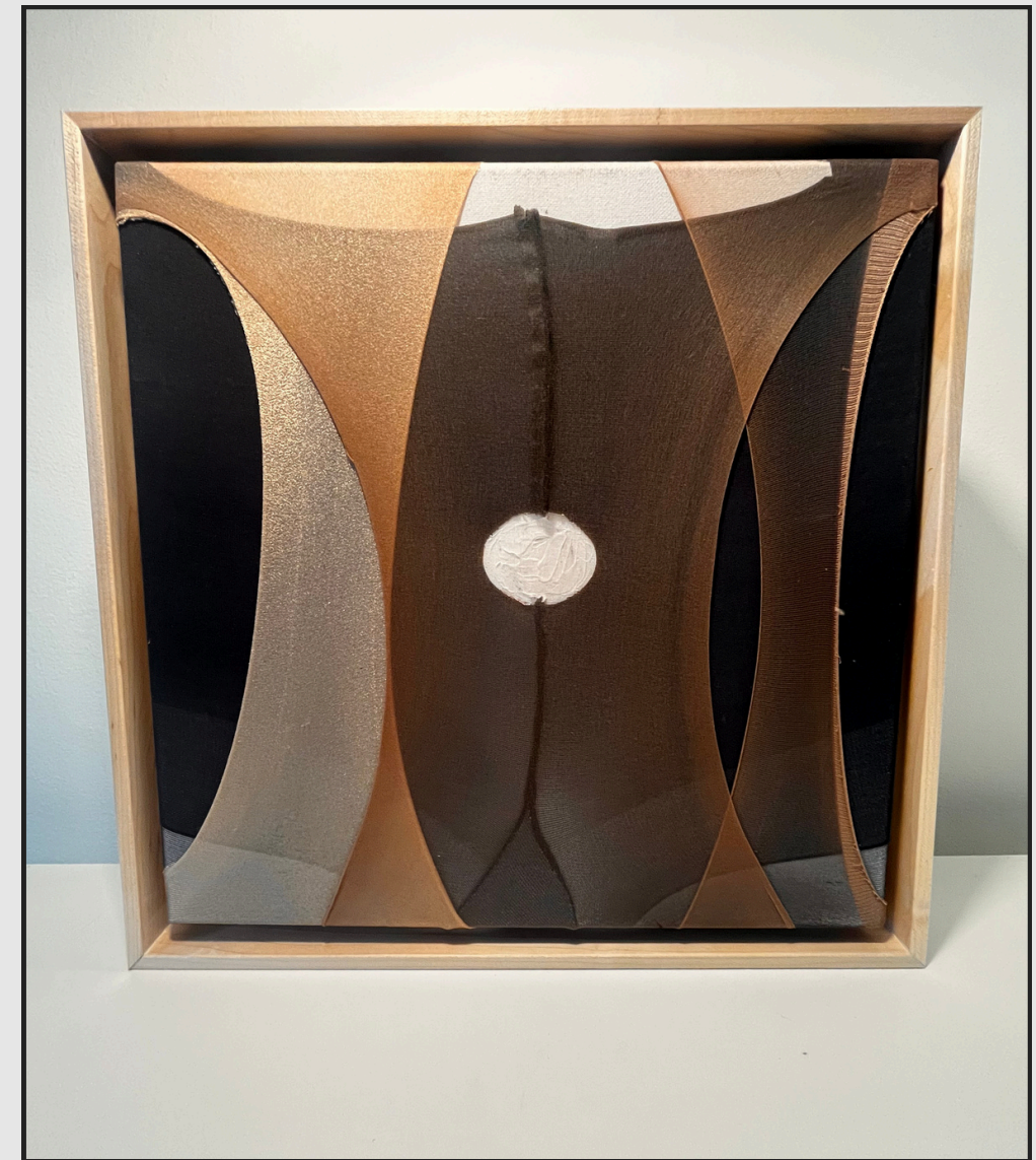
Title: Root Chakra Medium: nylon stockings & oil paint Dimensions: 14x14