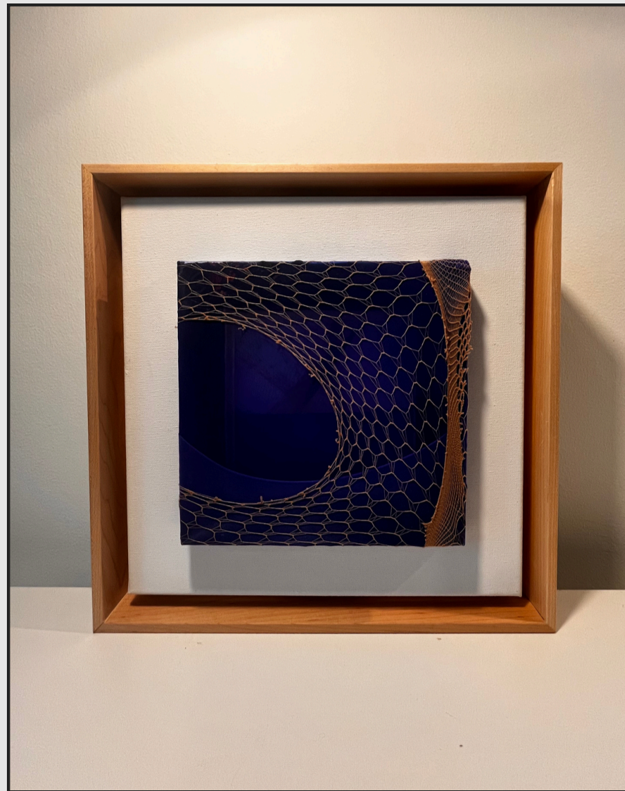
Title: Blooming Support Medium: nylon stockings, oil painting Dimensions: 13.1"x13.1"