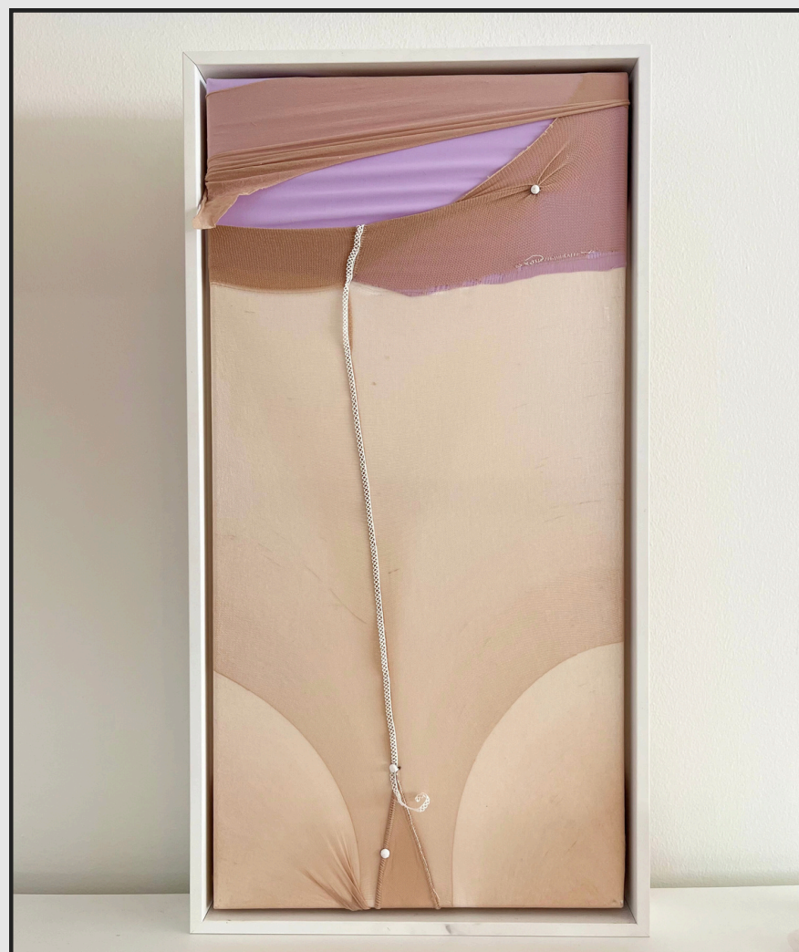
Title: Intimacy Medium: Pantyhose, lycra, Dimensions: 13 x 25