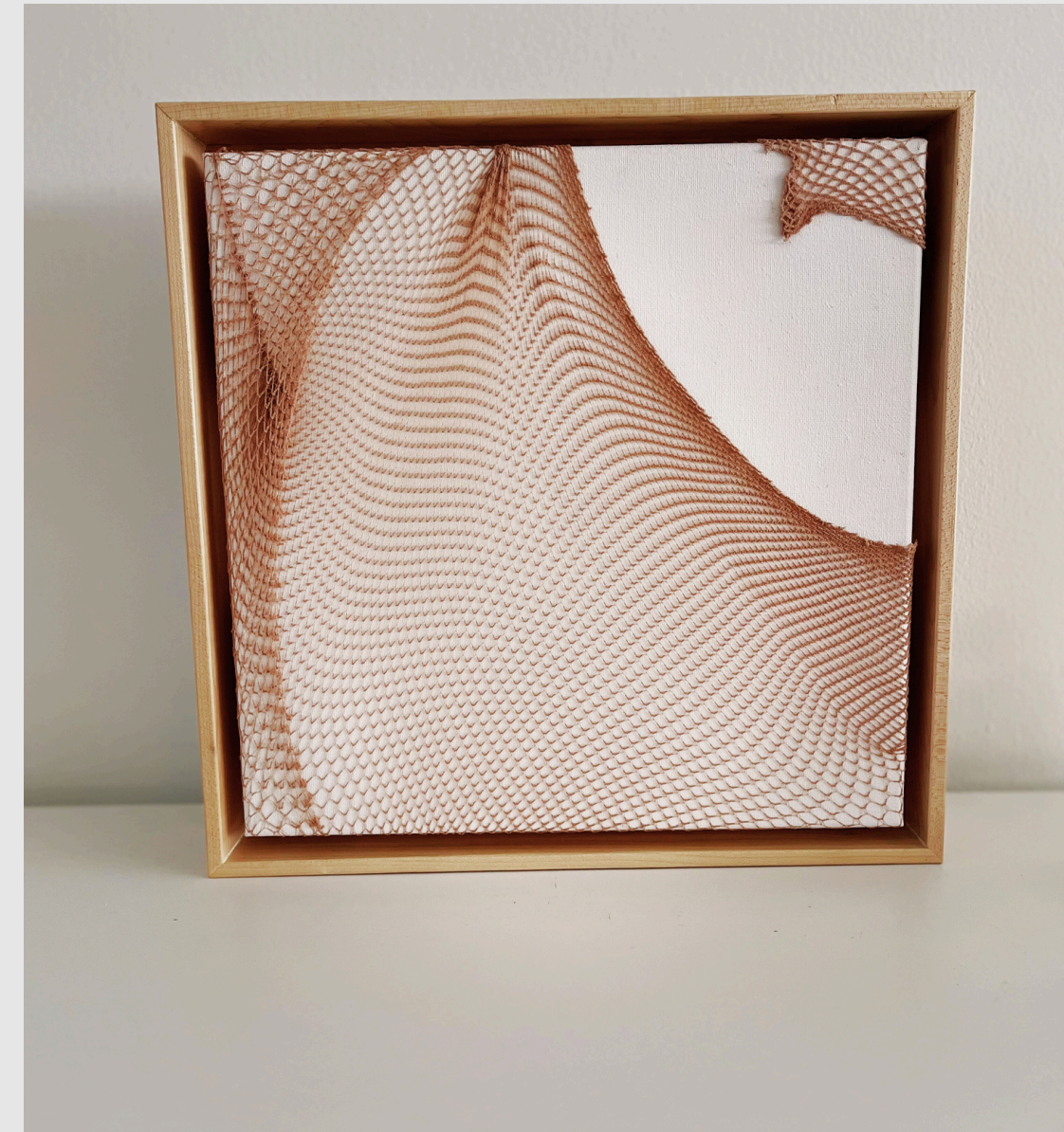
Title: Medium: nylon stockings on canvas Dimensions: 13.5" x 13.5"