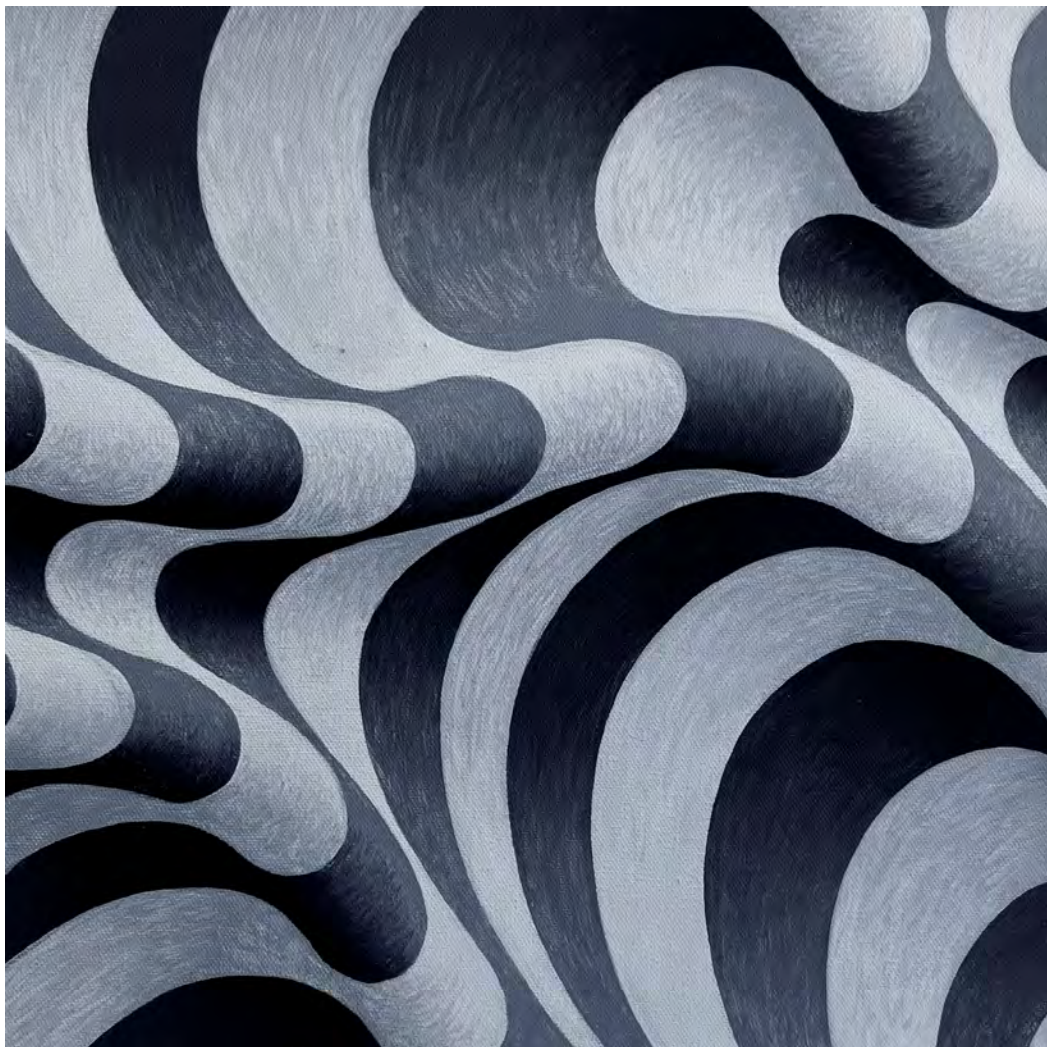
YULI1944, 2023 Series Ondulacoes Acrylic on Canvas 12 x 12 in $3,000