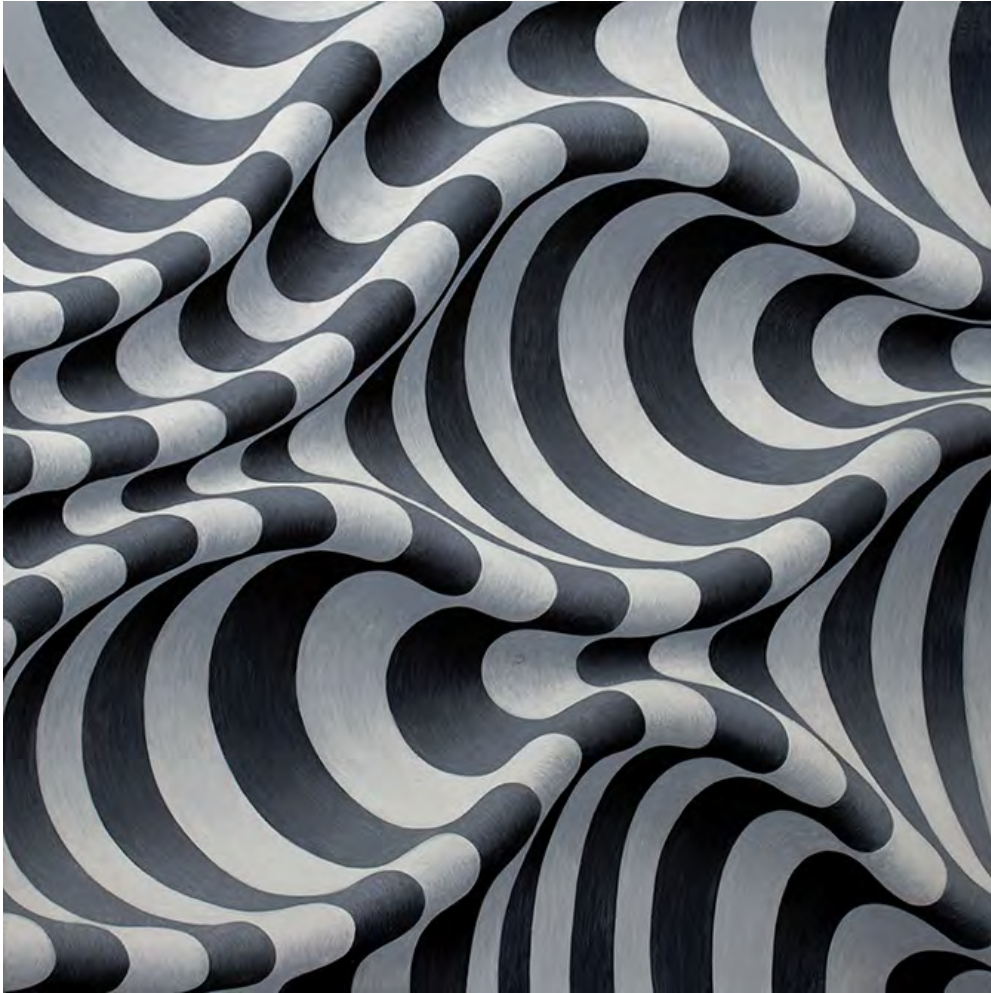
Untitled, 2023 Series Ondulacoes Acrylic on Canvas 37" x 37" $7,500